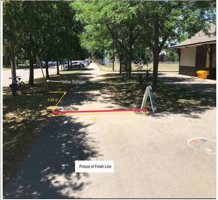
Picture of Finish Line