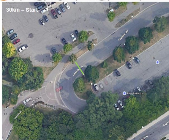
30km – Start

Start – On Leander Dr, east of gate to Pier 4 Park. 30 cm from south curb edge, 3 m northwest of pole D404