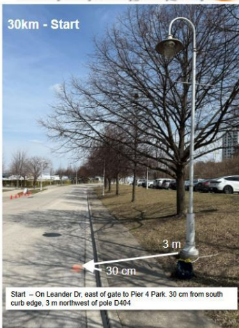
30km - Start

Start – On Leander Dr, east of gate to Pier 4 Park. 30 cm from south curb edge, 3 m northwest of pole D404