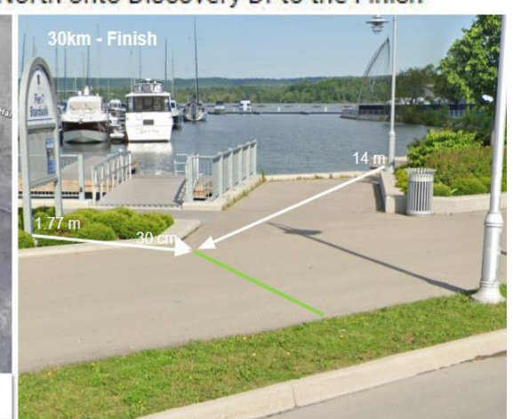
30km - Finish

Finish – On Waterfront Trail, adjacent to Pier 7 Boardwalk. South of Williams. In line with corner of low curb next to Pier 7 Boardwalk sign. Nail is 30 cm east from the curb edge, 1.77m north east of east edge of pier 7 boardwalk sign & 13.5 m southwest of telephone