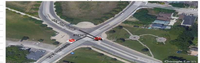
Around the Bay Road Race Road closures in effect from 9:00 am-11:30 am