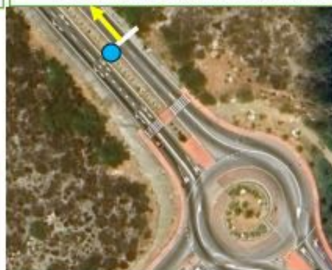
Roundabout Sero Grandi