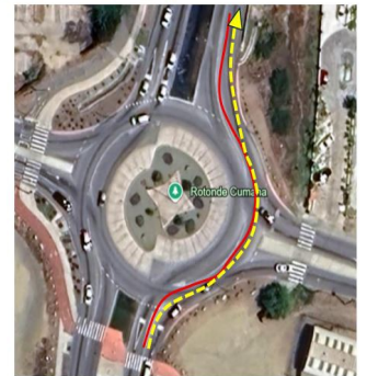
Widing Section # 4 (Roundabout Cumana)