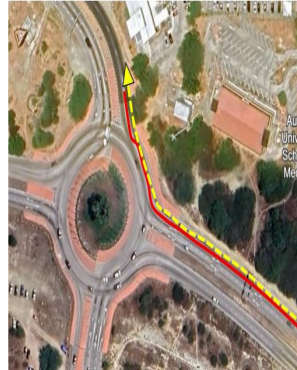
Widing Section # 2 (Roundabout Int. Airport Reina Beatrix)