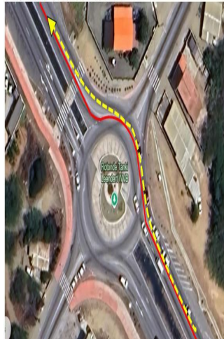
Widing Section # 6 (Roundabout Tanki Leendert)