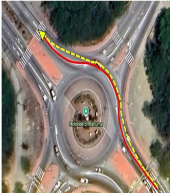
Widing Section # 1 (Roundabout Mahuma)