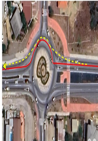
Widing Section # 7 (Roundabout Ponton)