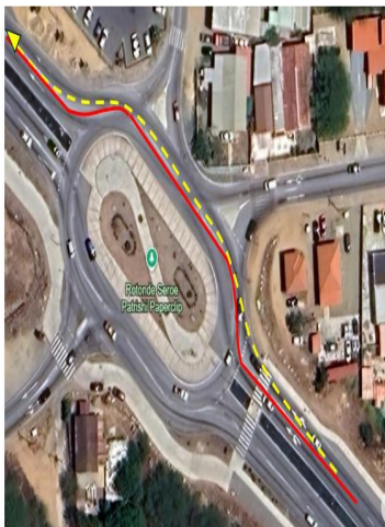
Widing Section # 4 (Roundabout Patrishi 'Paper Clip')