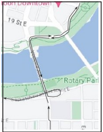
Detail of area shown in rectangle First Pass

T1 = First Turnaround at 10.647km T1 is 39.5m north of steel post by the irrigation box north of the Meewasin Park entrance. T2 = Second Turnaround at 32.131km T2 is 63.5m north of the signpost at the north end of guard rail.