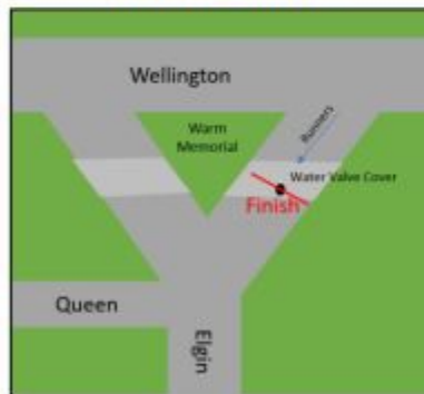
Finish Line Detail