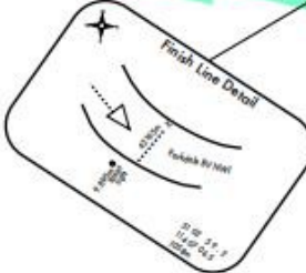
Reference Course Km Points! for detailed layouts