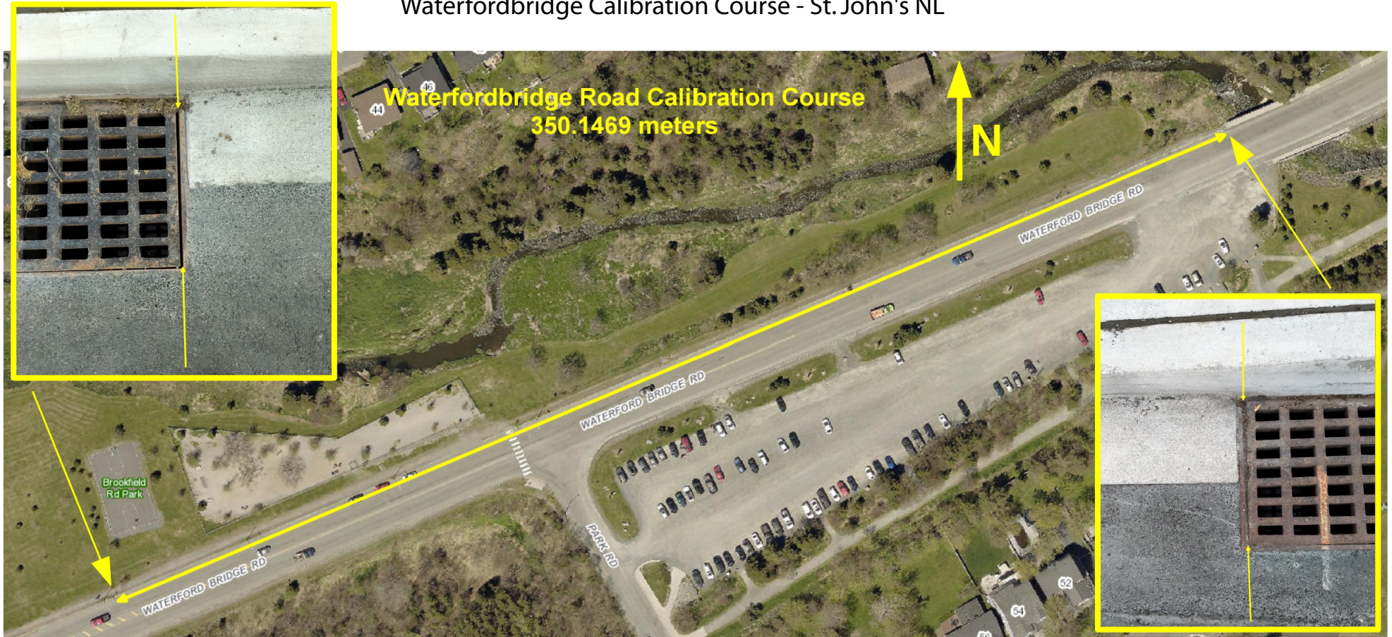
Waterfordbridge Calibration Course - St. John's NL

Athletics Canada Certified NL-2019-015-PTBA