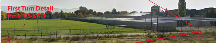
First Turn Detail Km's 1.5 & 6.5

For the 10 km race, the Start/Finish is at the point marked km's 3, 5, 8 and 10. Runners go north to First Turn, back through the start to Second Turn, to the First Turn for the second time; to the Second Turn for the second time and then to the Start/Finish