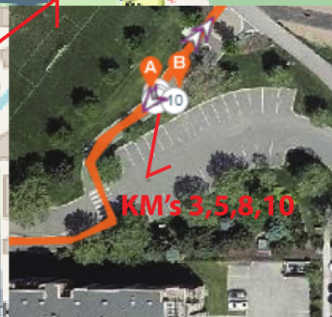
KM's 3, 5, 8, 10

Start/Finish Line Detail 5 4.87 meters south from 5/8" Washer to north east corner of Drain in Parking Lot. Stainless Pin is 6" inset of east side of Angel Way Trail