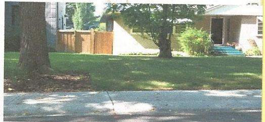
Between 9118 and 9122-117 St. NW 3 cm south of sidewalk joint between properties