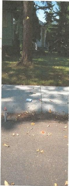
Across from 1st large elm tree at 11703 Edinboro Rd. NW. Exactly on 1st straight sidewalk joint on Street, marked with nail and metal washer