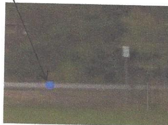
Clou #2 :

Clou #1 : 10.245 M du poteau électrique , 2.759 M du poteau NO de la piste cyclable, 5-6 mètres au Nord du 1537 L'annonciation Sud