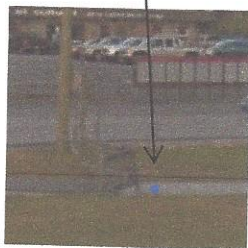
Clou #1 :