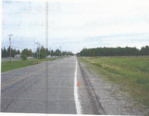
300 METRE CALIBRATION COURSE-- LOOKING SOUTH, PYLON MARKS START OF COURSE