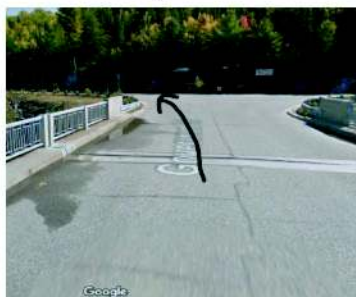
Measured on shortest Distance No restrictions