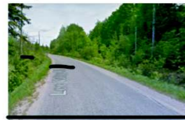
The turn is approximately 7.8 km from the start